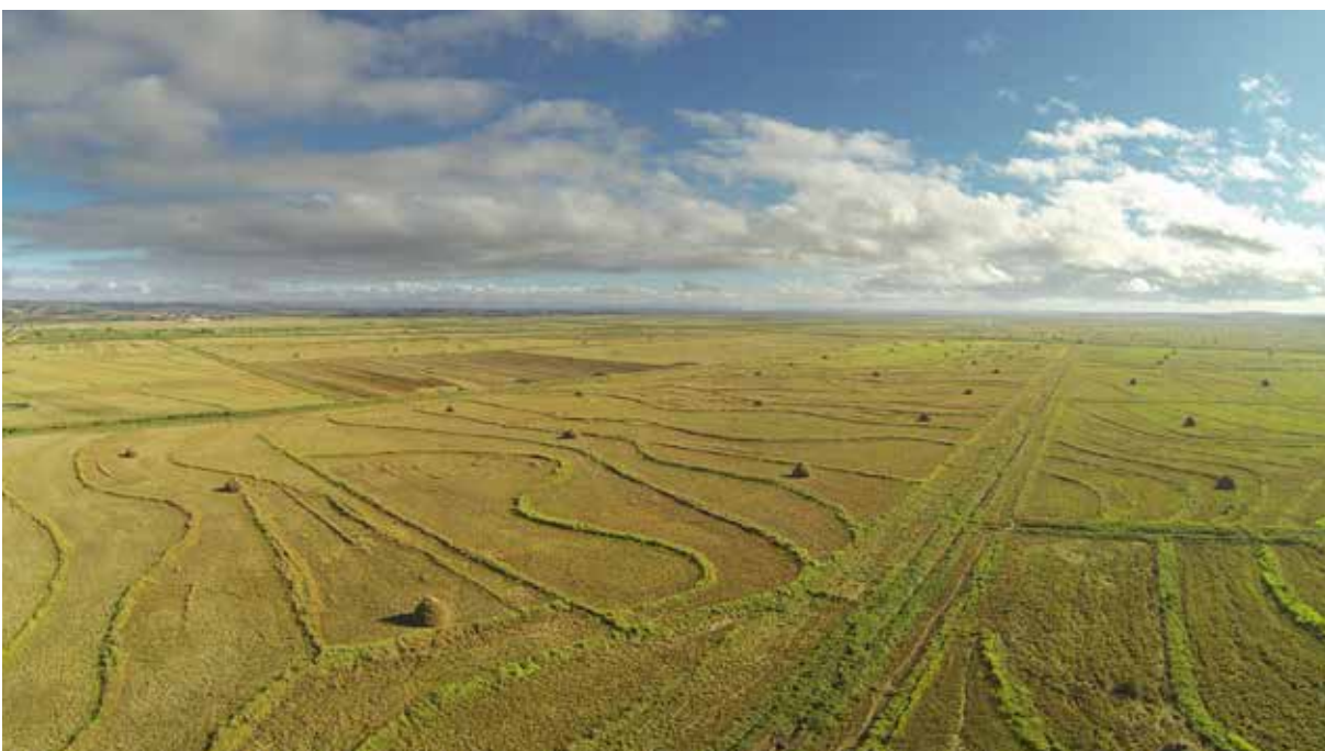
Aerial photo of farmland in Madagascar