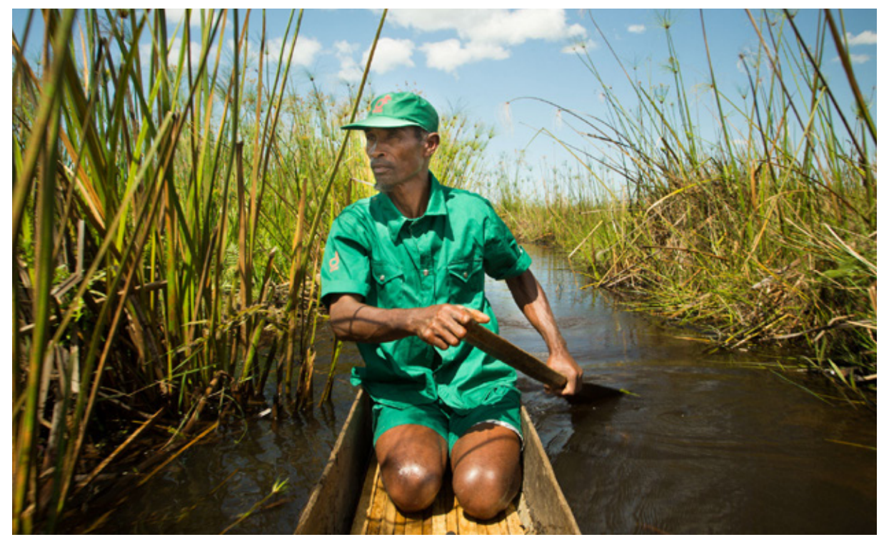
Durrell ranger on Lac Alaotra