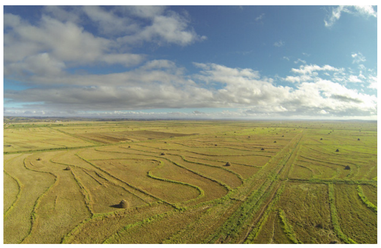
Aerial photo of farmland in Madagascar